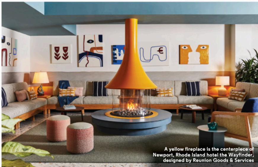
A yellow fireplace is the centerpiece of Newport, Rhode Island hotel the Wayfinder, designed by Reunion Goods & Services