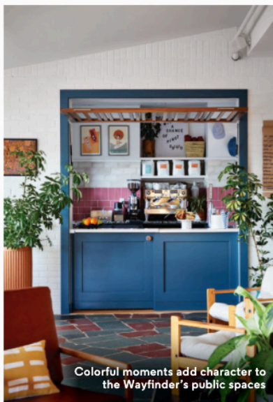
Colorful moments add character to the Wayfinder's public spaces