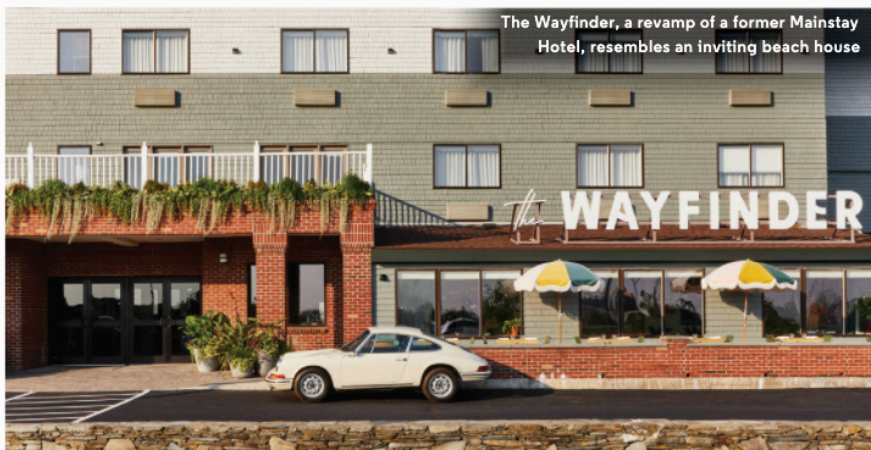
The Wayfinder, a revamp of a former Mainstay Hotel, resembles an inviting beach house