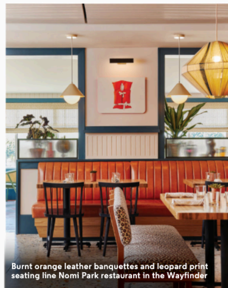
Burnt orange leather banquettes and leopard print seating line Nomi Park restaurant in the Wayfinder