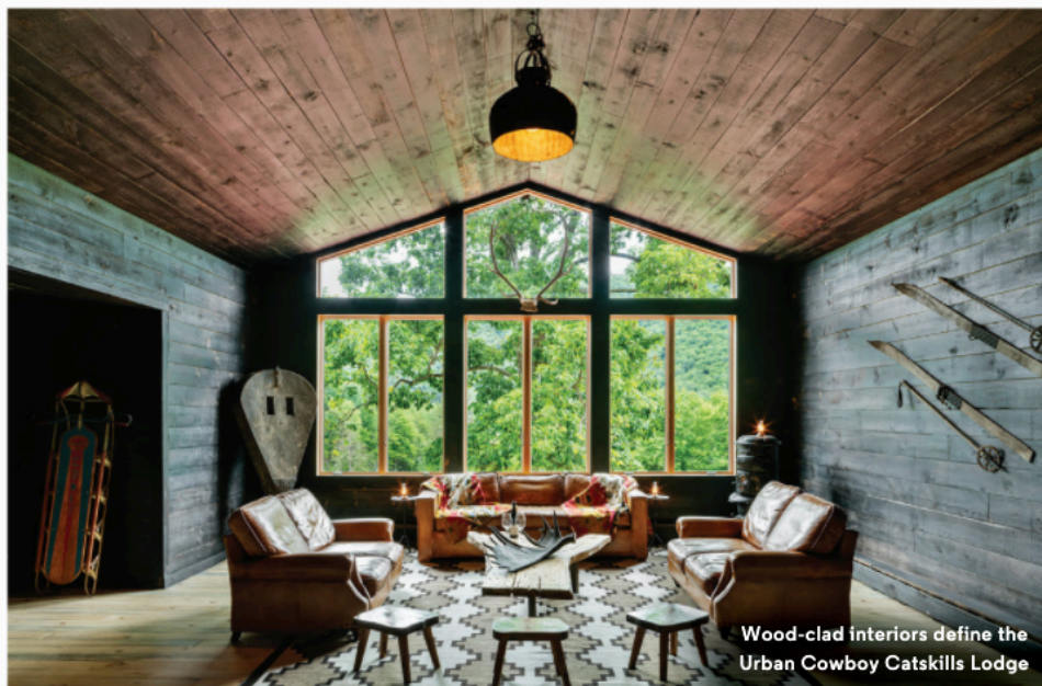
Wood-clad interiors define the Urban Cowboy Catskills Lodge